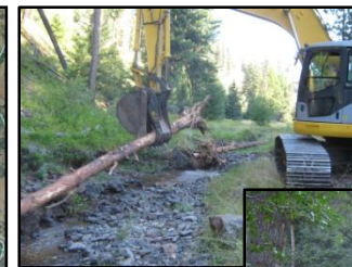
Dark Canyon Project